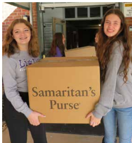
Our Varsity Cheerleaders, Boys Basketball, and Girls Basketball teams gathered together to pack Operation Christmas Child boxes before Thanksgiving Break.